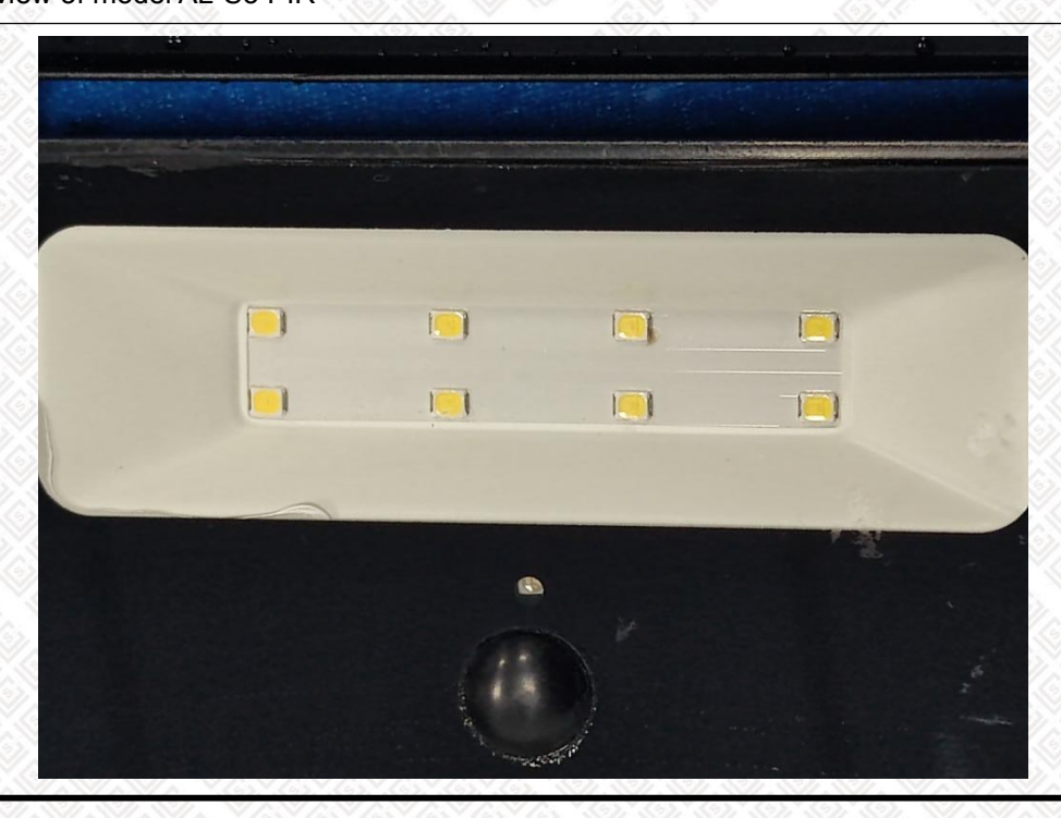
---- End of Test Report----